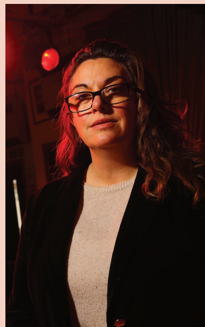
Matilda, Things I know to be True (Frantic Assembly) and Cymbeline (Kneehigh)

That's like asking me to pick my favourite child! Can I do a top 5? Hamilton, Les Misérables,