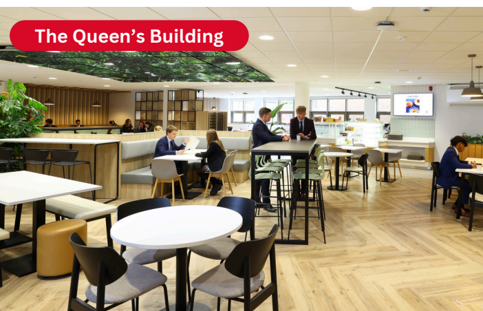
The Queen's Building

Our dedicated wellbeing center houses a comprehensive pastoral team including counselors, a Child and Adolescent Psychotherapist, an Art Psychotherapist, our Chaplain, and therapy dog Heidi, providing a calm, supportive space that also accommodates learning support services.